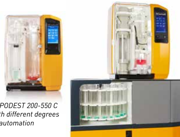
VAPODEST 200-550 C with different degrees of automation