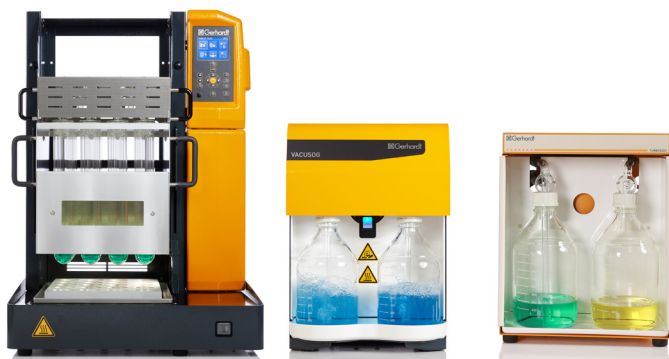
KJELDATHERM and VACUSOG / TURBOSOG scrubber