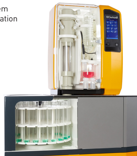
VAPODEST 500 C with autosampler

Distillation system Distillation + Titration