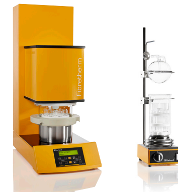
FIBRE THERM and manual FibreBag system

Fibre extraction Crude fibre, ADF, ADF om , NDF, NDF om , aNDF om