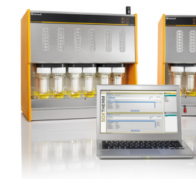
Available as 2-, 4- or 6-places unit