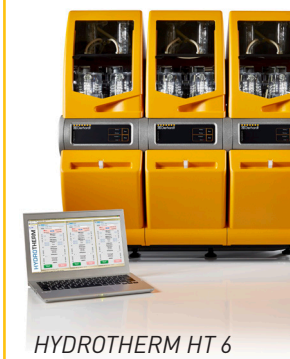
HYDROTHERM HT 6