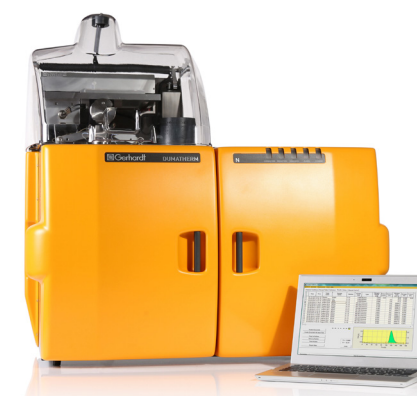
DUMATHERM N Pro